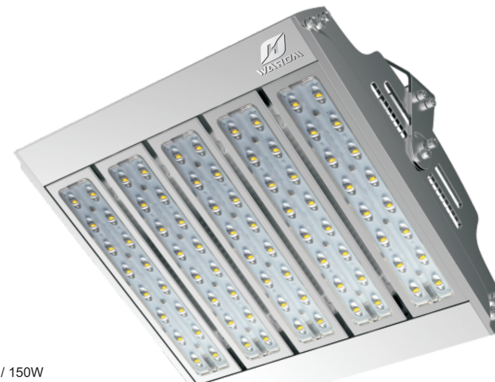
HR5101 60W / 90W / 120W / 150W